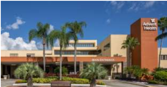
AdventHealth Hospital – Zephyrhills

older population. Oaks Royal III will open its clubhouse to residents Tuesday's at 11:30am for these Noon presentations, that will be displayed for easy viewing on the associations big screen television. Residents that pre-register on the AdventHealth website, or sign a AdventHealth registration card the day of, will be eligible for an exclusive coupon to the AdventHealth Wellness Center Zephyrhills. To pre-register please click on the name of the program you are interested in below. All the programs are free.