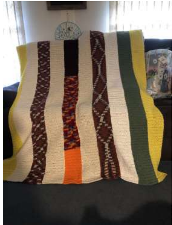
Blanket crocheted by group