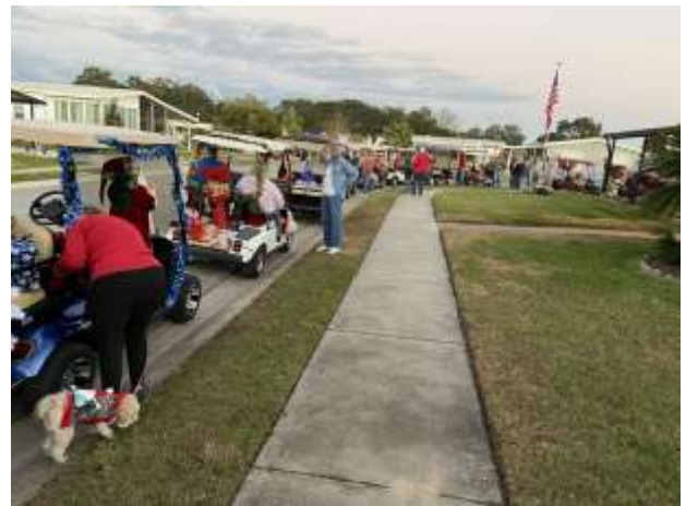
Parade participants lining up

Participants started lining up for the parade about 5:20pm. By 5:40pm the full complement of 25 golf carts and a bike were in line, making their final checks on lights, batteries, generators, etc. Parade organizers were handing out Merry Christmas bags of goodies to make sure the participant's spirits (and sugar levels) did not flag during their sojourn through both park that evening. Making merry, waving, laughing and having a good time is hard work you know!