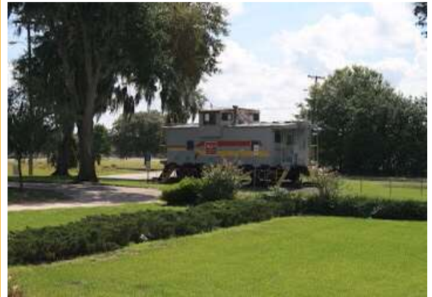
Caboose at Depot Park from website

The original 1927 Atlantic Coast Line Depot was purchased from CSX Railroad by the City of Zephyrhills in 1989 and relocated 200 feet west of its original location. Restoration of the 2,700 square foot building began in 1997 with a Grant from the State Department of Transportation, and a ribbon cutting ceremony was held November 19, 1997, to celebrate its completion. The Historical Preservation Committee and the Zephyrhills Historical Association assisted in many ways to bring this restoration to reality.