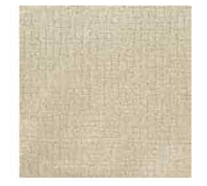
COLOR 9785 cypress point