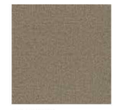
COLOR 9999 sand hills