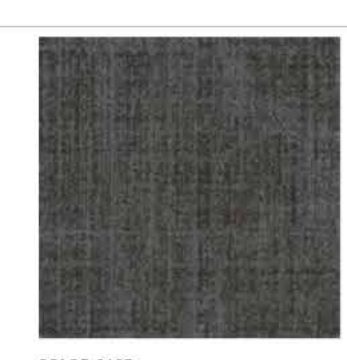
COLOR 2627 weathered