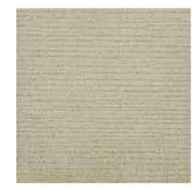
COLOR 9832 pebble beach