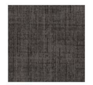
COLOR 2639 galvanized