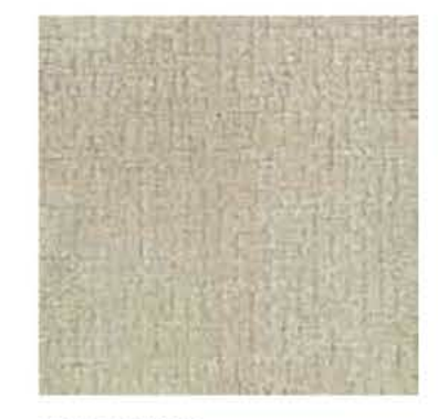
COLOR 9832 pebble beach