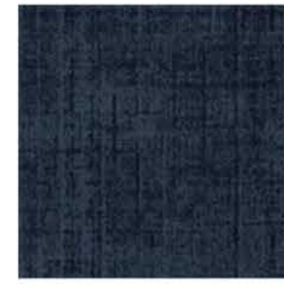
COLOR 2630 tailor