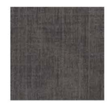
COLOR 2754 aspect