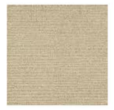
COLOR 9785 cypress point