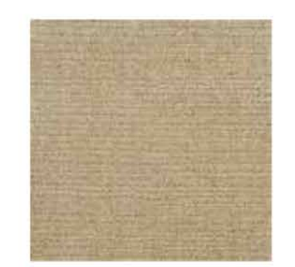
COLOR 9770 pinehurst