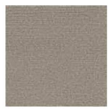
COLOR 9925 saw grass