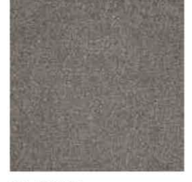
COLOR 9945 glen abbey