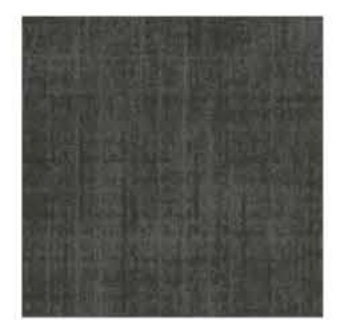
COLOR 2757 castor