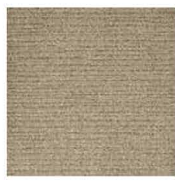
COLOR 9792 augusta