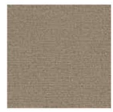
COLOR 9999 sand hills