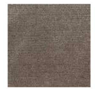
COLOR 9945 glen abbey