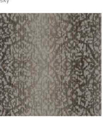
coLor 3236 sandstone