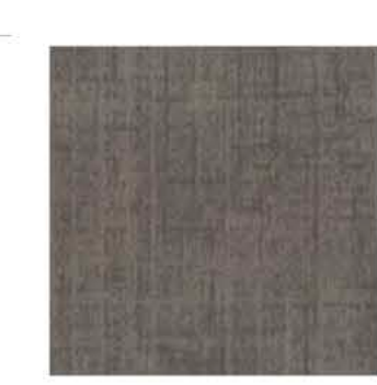
COLOR 2753 composite