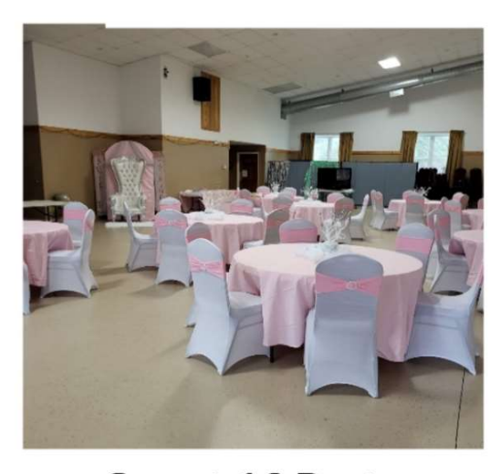
Sweet 16 Party