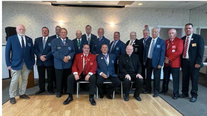
Columbiette Rita's Ices Fundraiser