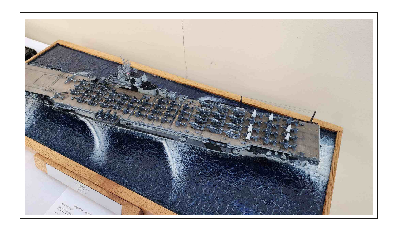
The winner of the best in show was a 1/350 USS Hancock from April 1945. It was superb.

The highlight of the show for me was meeting Rock Roszak from Detail & Scale Publications. They are in my opinion some of the best aircraft modeling references out there.