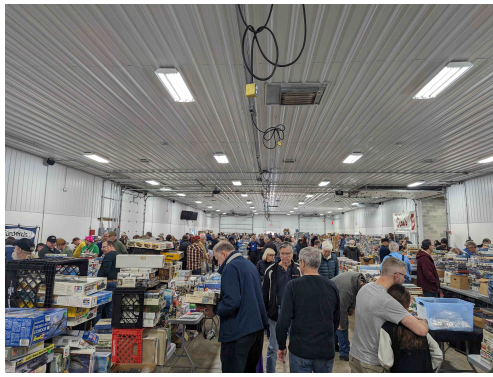
A very busy Vendor room at the Roscoe Turner Show.