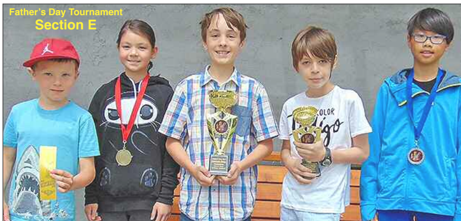
Father's Day Tournament Section E