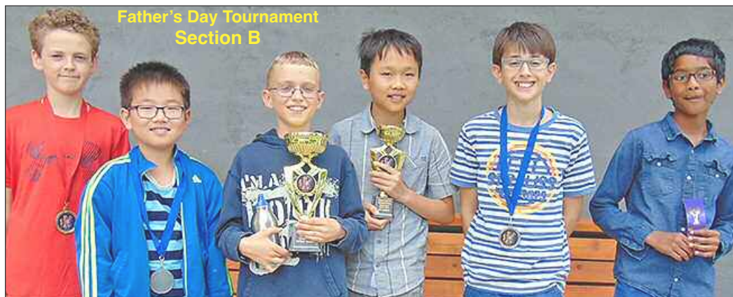
Father's Day Tournament Section B