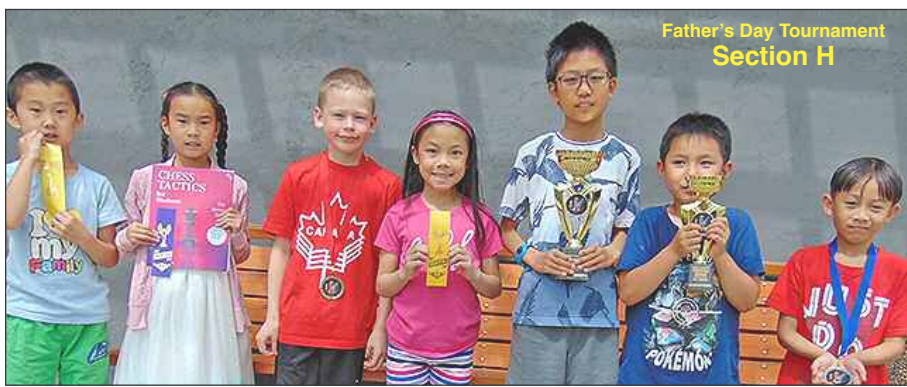
Father's Day Tournament Section H