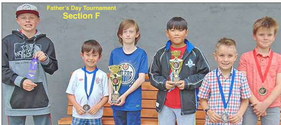
Father's Day Tournament Section F