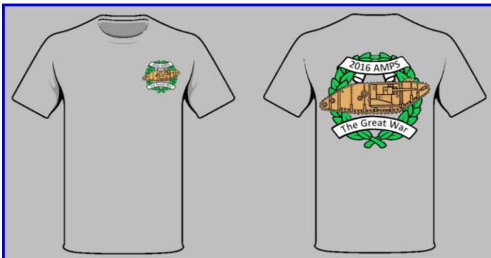
Proposed Show T-shirt