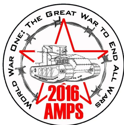
Logo #1 (most votes)

Well, your 2016 Convention Committee has been hard at work over the last month putting together tentative logo designs to complement this theme, and last week, after reviewing over 20 logo designs, your committee selected these two: