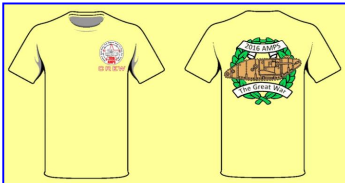
Proposed Crew T-shirt