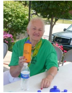
Lovely maintained gardens. Bike event sponsored by Faith Communities of Villa Park.