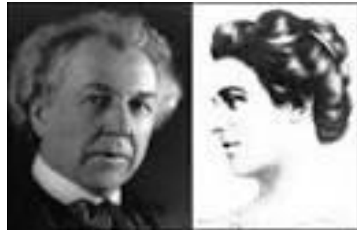
Frank Lloyd Wright and Mamah Cheney Wright

Mark down your calendars for Saturday, October 4, 2014. This year's Antique Safari bus outing will be going to Peru, IL. Several stops are scheduled. The bus leaves the museum at 8:00 am and returns at 5:00pm. The cost is $45. Sign up forms are available at the museum. RSVP by September 13 th .