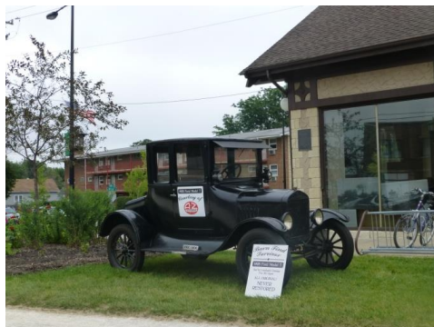
The 1925 Model T Ford Doctor's Coupe.