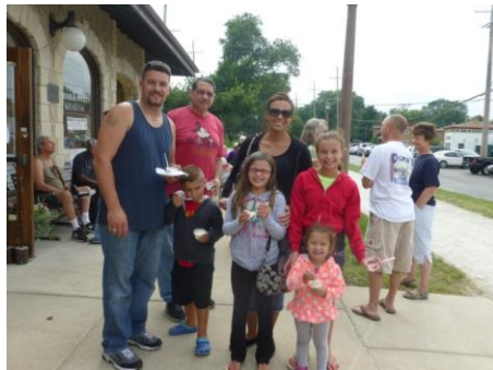
Enjoying ice cream.