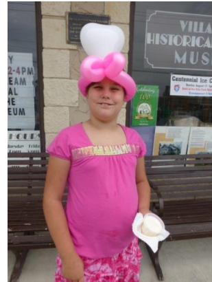
A very creative balloon hat.