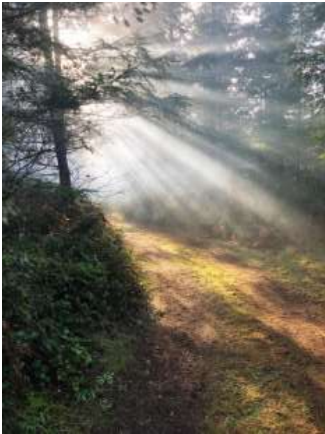
The sun came out on the trail walk

are board members at Upper Nisqually and want to get this going as a monthly shoot, with the ultimate goal of hosting a rendezvous in 2021. They are still working with the club to find a recurring day for their monthly shoot. Stay tuned for more information, and lets help support a new group get started in muzzleloading!