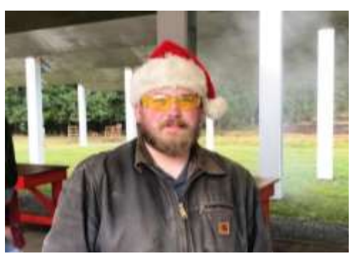
and this year the muzzleloading community was very generous.

Oh the weather outside was frightful delightful as we gathered for the annual Paul Bunyan Christmas shoot and fundraiser for Toys for Tots. Unlike most of the monthly shoots here, there was no need to pick up a target frame to hang your stockings paper targets on. This month, Chip Kormas provided a novel approach and had a combination of steel silhouettes, balloons, and holiday targets, but more of that in a moment. In lieu of a shooters fee, we ask for donations to Toys for Tots,