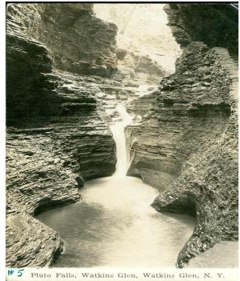
Pluto Falls at Watkins Glen

We hope to see many of our members and guests there.