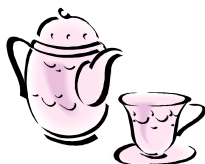
Victorian Tea at the Brick Tavern Museum.

Price per person is $12, ages 10 and under $6. Please call