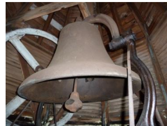
Photo #4 This photo shows the original bell, now 127 years old. Due to years of wear, the bell has shifted to one side actually hitting the support member causing the entire structure to rock badly when being rung.

Photo #3 The wooden structural members in the left half of the photo are above the gray blocks but those on the right have slipped off causing the entire bell tower to lean to one side. (See page over –page 6, Bell article)