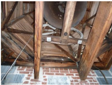
Photo #2 This photo shows the inside of the bell tower just above the ceiling of the entrance to Fellowship Hall.

Photo #1 Shows how the bell was displayed in the bell tower of the original church. This same bell, erected in 1888, currently resides in our bell tower.