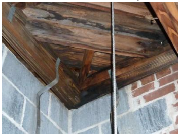
Photo #3 The wooden structural members in the left half of the photo are above the gray blocks but those on the right have slipped off causing the entire bell tower to lean to one side. (See page over –page 6, Bell article)

Photo #2 This photo shows the inside of the bell tower just above the ceiling of the entrance to Fellowship Hall.