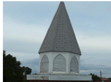
Photo #5 A photo from the outside showing how the bell tower is leaning.

Photo #4 This photo shows the original bell, now 127 years old. Due to years of wear, the bell has shifted to one side actually hitting the support member causing the entire structure to rock badly when being rung.