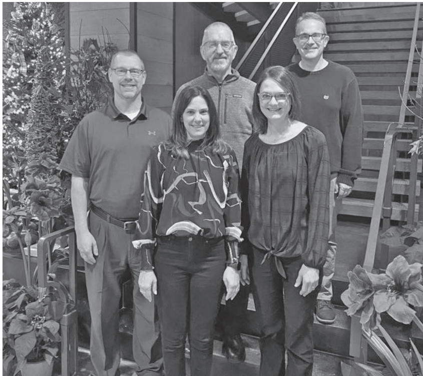
Christmas joy from the North Wisconsin District staff. Have a Merry Christmas and a blessed New Year!