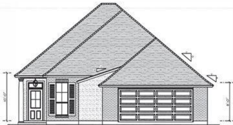
FRONT ELEVATION "A"