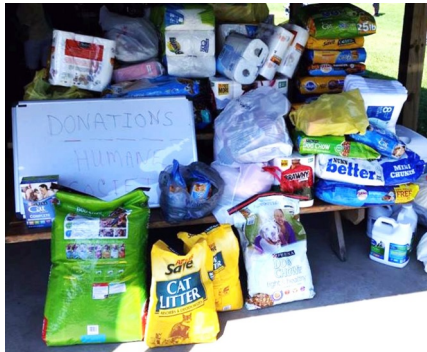
(Above): NW Indiana Rock And Rollers Club asked members to donate Wish List items at its August picnic.