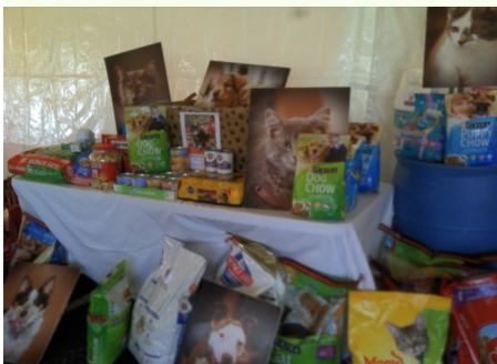
(Below): Munster Animal Hospital held a pet food drive for us in October and matched the food donated pound per pound.

In June HSNI's animals and volunteers did Adopt-A-Thons at Albanese Candy in Merrillville (6/6), Family Video in Griffith (6/13) and Duke Of Oil in Crown Point (6/27).