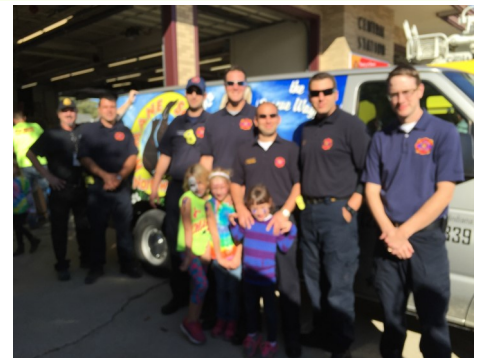
(Below): In Oct. HSNI were invited to hold an Adopt-A-Thon at the Highland Fire Dept.