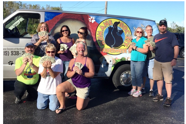
(Above) The 3rd Annual Merrillville Animal Hospital Giant Yard Sale wrapped up our summer fundraising. Staff and Volunteers of both MAH and HSNI raised $1974.00.