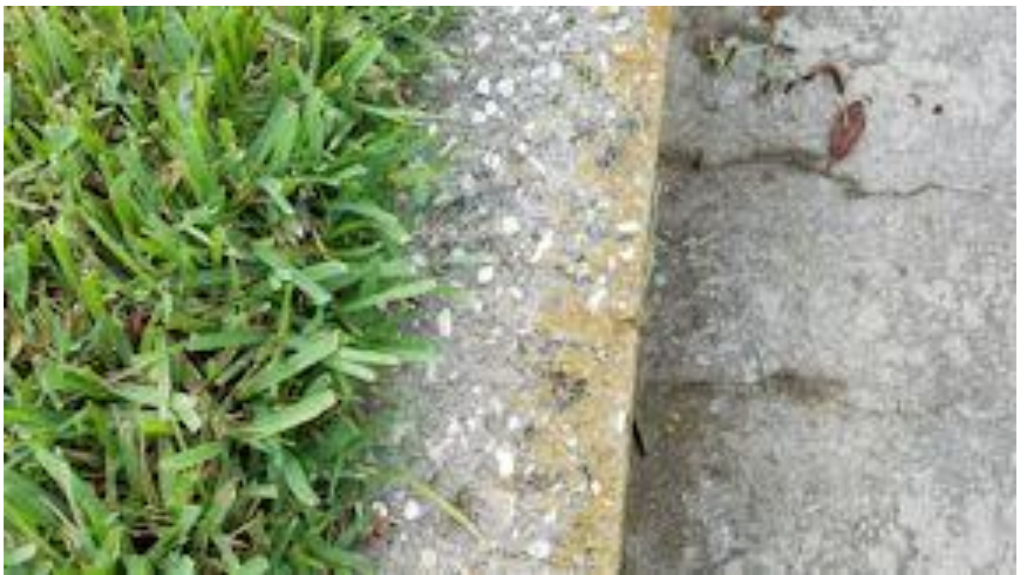
The Correct way to edge