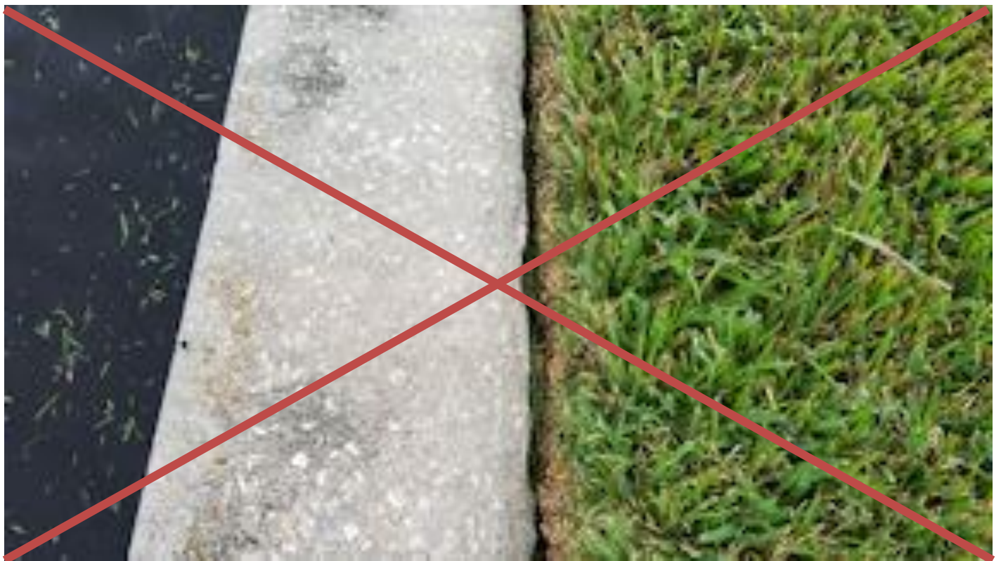
The Wrong way to edge