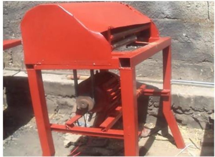
Fig 6. Fiber extraction machine