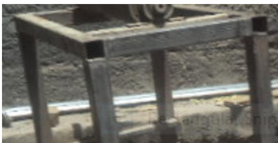
Fig. 3. Fiber Extraction Machine frame

As indicated in Fig. 3, the machine frame is made from 60x60x2 mm rectangular tubular iron steel which used to carry out machine parts. The machine frame has a dimension 110 cm height, 90 cm Length and 60 cm width.