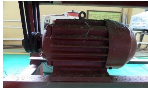
Fig. 4. Machine motor

Fig. 4, the Authors used 2HP electrical motor with 900 rpm. The machine motor is connected with main shaft by using two v-belts.