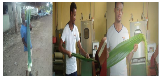
Fig. 7. Sisal fiber extraction by authors machine

As shown in Fig. 7, the authors extracted plant stem fiber in order to know production rate of the machine. The Authors used sisal and papyrus plant stem sample for extraction. They tried 5 sample extractions for 10 min for each samples. They extracted an average of 2.5 kg of sisal fiber within 10 min and an average of 1.5 kg of Papyrus fiber within 10 minutes. Based on the machine can extract an Average of 15 kg of Sisal fiber within an hour and can extract an average of 9 kg of papyrus fiber within an hour. In case of Manual fiber extraction, a person participated in natural fiber extraction in the area can extract around 20 kg of fiber per day. If someone used the new machine for fiber extraction, he or she can extract more than 100 kg of fibers per shift or within 8 hours. This indicates that, the new machine has higher production rate than manual fiber extraction.