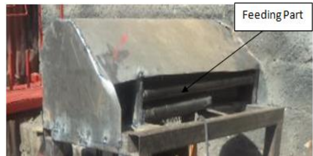
Fig. 5. Fiber stem feeding part

As indicated in Fig. 5, the machine has two fixed plant stem feeding roller and the drum is covered with 0.75 mm thickness sheet metal. Sheet metal is used to protect machine operators from danger.