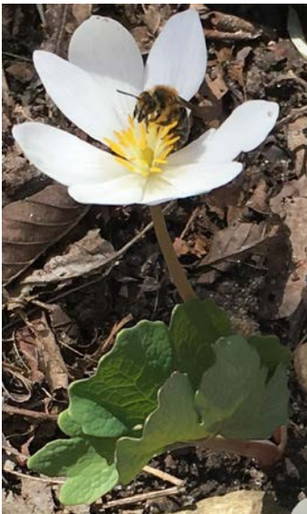
Bee on bloodroot flower

Emerging as early as March from last fall's bed of leaves, bloodroot is one of the first signs of spring across Minnesota. Named for the red sap in its roots, it was once used as a dye by Native American artists and in the natural dying of yarn and fabrics. Roots and rhizomes are toxic to touch, so should be handled with gloves and no part of the plant should be ingested. A single flowering stem grows from the ground, encircled by a single 3-5" wide leaf. Typically found in wooded areas, flowers require some sun to bloom and must do so before towering trees sprout leaves and shade the forest floor. Once bloomed, leaves will unfurl and the fragrant flowers lasts only 1-2 days, closing at night – traits typical to the poppy family of plants. Leaves will persist throughout the growing season.