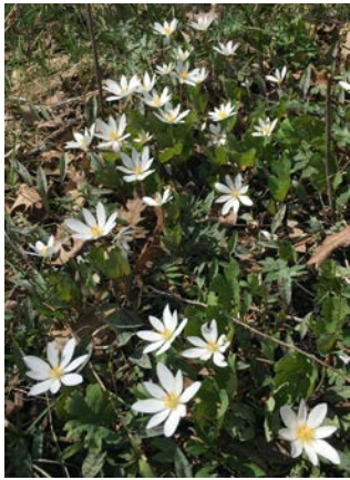
Flowers in colony