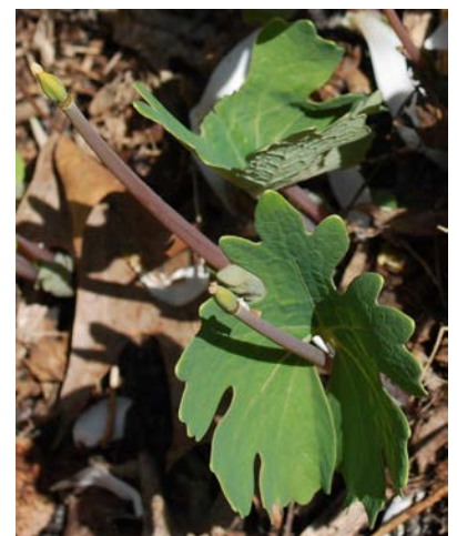
Flower stalk and leaves

MN range of bloodroot University of MN Bell Museum Herbarium records, 2014.