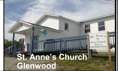
St. Anne's Church Glenwood