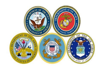
May 16th – Armed Forces Day