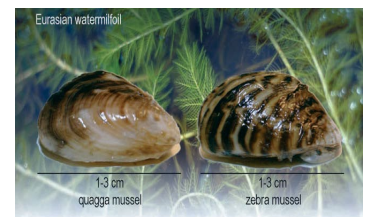
Quagga & Zebra Mussels

Do not wash Vehicles, ATV's, Boats etc. in the lake!!