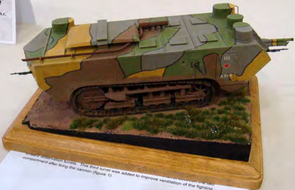
...turret between the two compartment after firing the cannon (figure 1).

PS N CHAPTER ille NC AMPS FAYETTEVILLE N.C. ory II