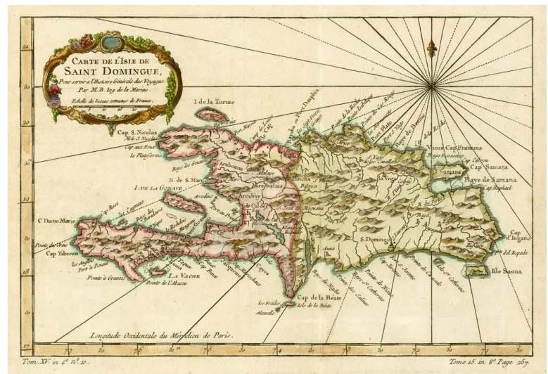
French Colony Of St. Domingue (In Red) -- Site Of Louverture Rebellion Hiapaniola Island, with the Western Third Saint-Dominigue (Later Haiti)

Starting in August 1791 a remarkable revolution is carried out on the French colony of Saint-Domingue by black slaves, under the leadership of one Toussaint Louverture.