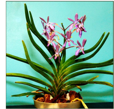
Darwinara (Dar.) Blue Pacific' - Darlene Thompson