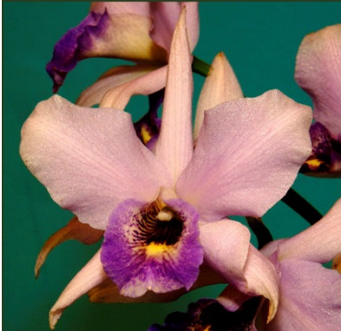
Laeliocattleya (Lc.) Wrigleyi 'Blue Lagoon' HCC/AOS - Jane Bush