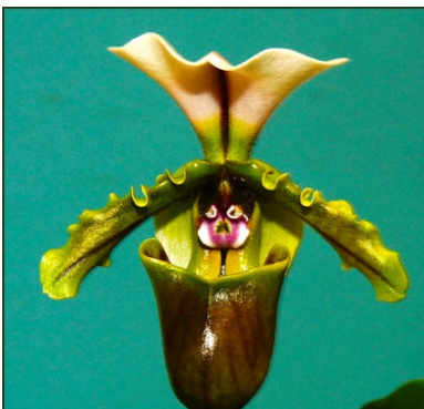
Paphiopedilum (Paph.) spicerianum