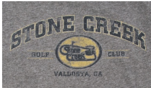
Distressed (washed or true color)