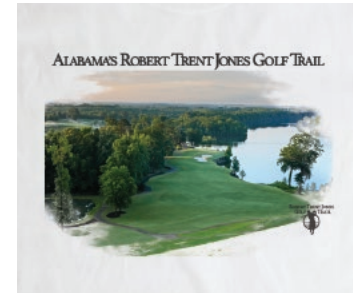
True Color / Photographic

NEW ORDERS: 36 pieces per logo, 6 per style / color / ink colors REORDERS: 12 pieces per logo, 6 per style / color / ink colors LEAD TIME: 5-7 days after art approval UNLIMITED NUMBER OF INK COLORS PER DESIGN