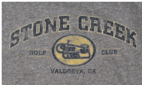
Distressed (washed or true color)