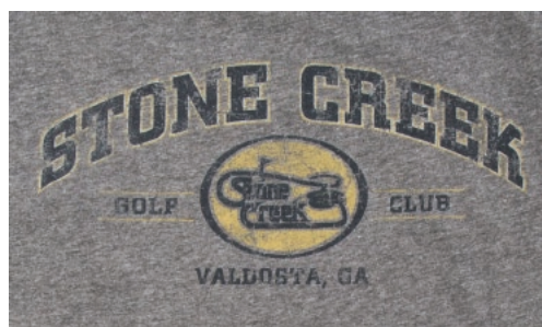
Distressed (washed or true color)