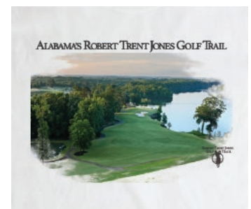
True Color /Photographic

NEW ORDERS: 36 pieces per logo, 6 per style / color / ink colors REORDERS: 12 pieces per logo, 6 per style / color / ink colors LEAD TIME: 5-7 days after art approval UNLIMITED NUMBER OF INK COLORS PER DESIGN