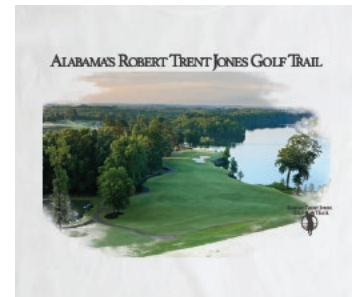
Ture Color /Photographic

NEW ORDERS: 36 pieces per logo, 6 per style / color / ink colors REORDERS: 12 pieces per logo, 6 per style / color / ink colors LEAD TIME: 5-7 days after art approval UNLIMITED NUMBER OF INK COLORS PER DESIGN