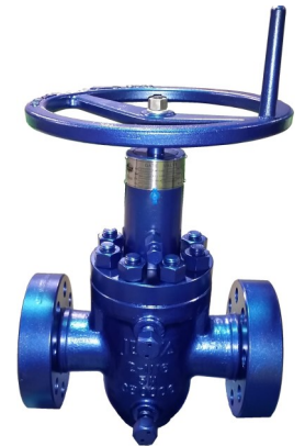
WKM Expansion Valve