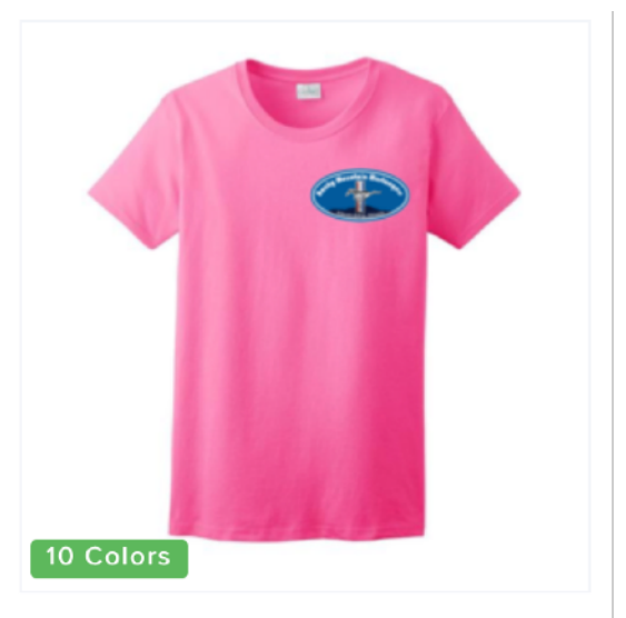
Gildan <sup>®</sup> - Ladies Ultra Cotton <sup>®</sup> 100% Cotton T-Shirt $12.00