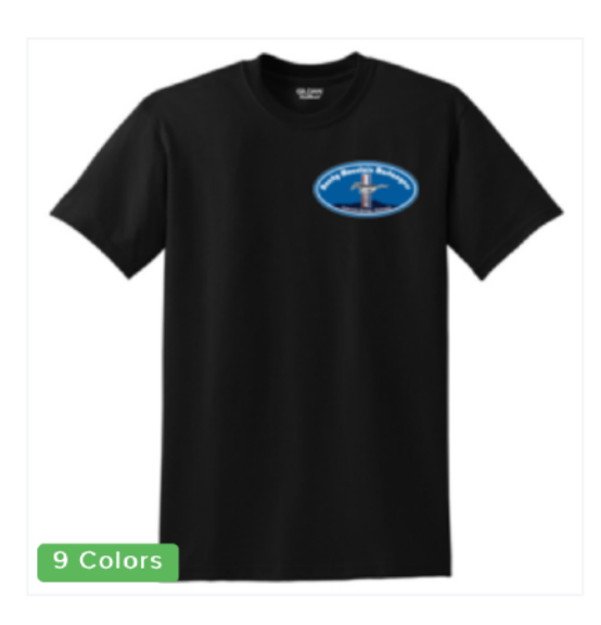
Gildan - DryBlend 50 Cotton/50 Poly T-Shirt $12.00