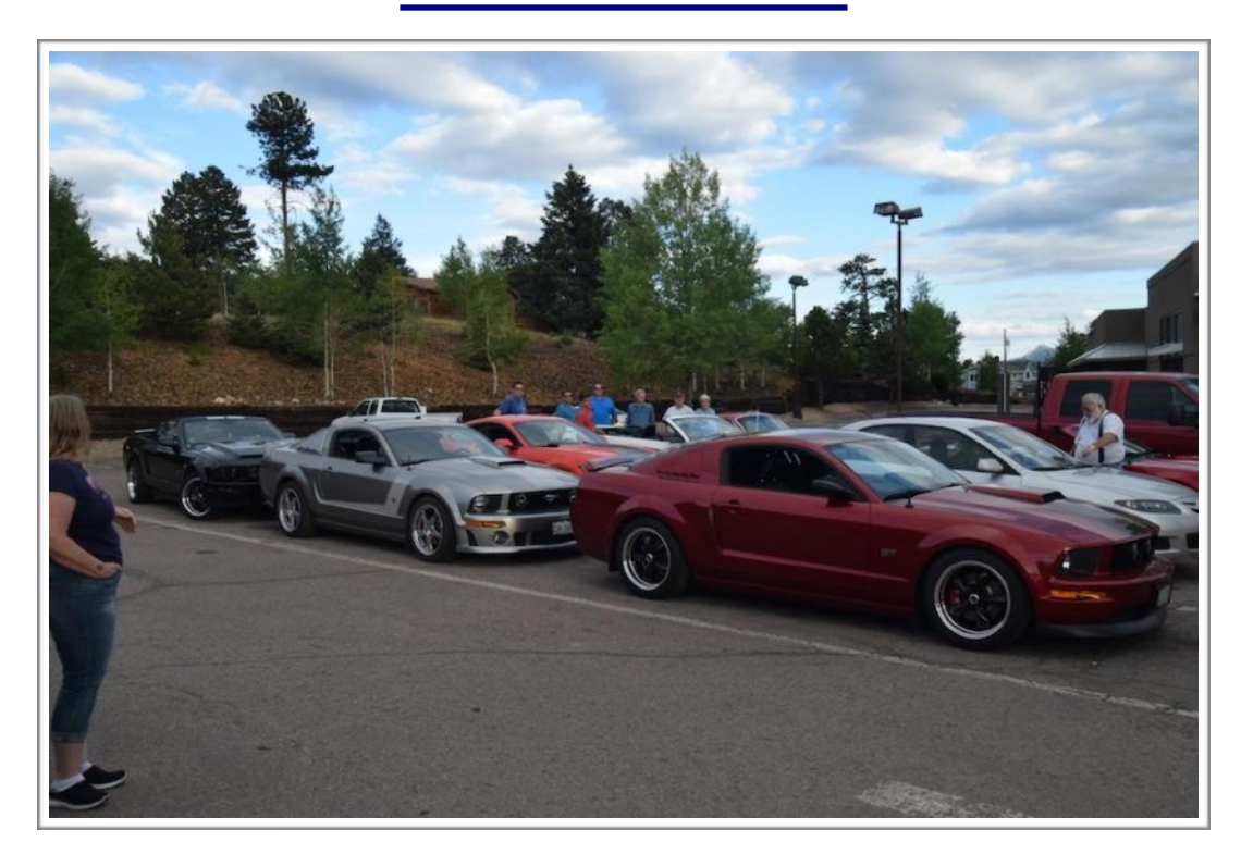
Cruise to Castle Rock ... Staging at Mimi's ...