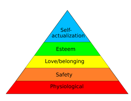
Maslow's Hieracrchy of Needs

physiological, is at the bottom and includes those things required for human survival: air, water and food. Next, are safety needs: personal security, financial security, and health. At the peak of the pyramid is a person's desire to accomplish. Nowhere on Maslow's pyramid will you find hydroplane racing, or NFL football, for that matter.