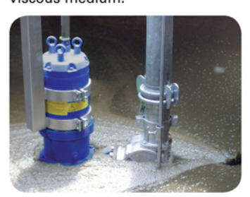
Slurry pumps with unique pumping capacity, powerful chopper.