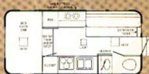
DRY WEIGHT, STANDARD EQUIP. — 2240 lbs.