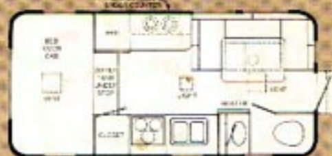
DRY WEIGHT, STANDARD EQUIP. — 2240 lbs.