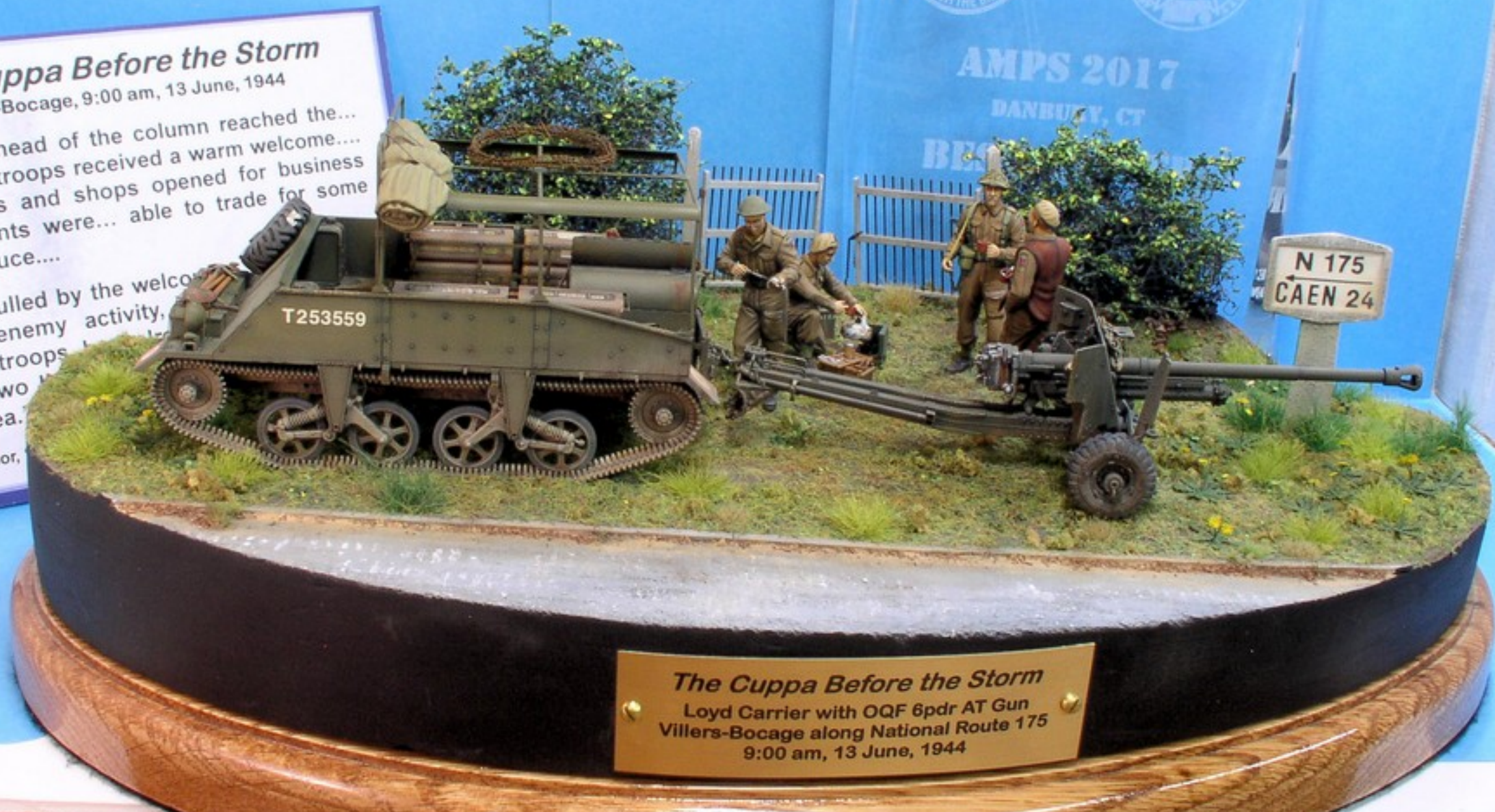
The Cuppa Before the Storm Loyd Carrier with OQF 6pdr AT Gun Villers-Bocage along National Route 175 9:00 am, 13 June, 1944