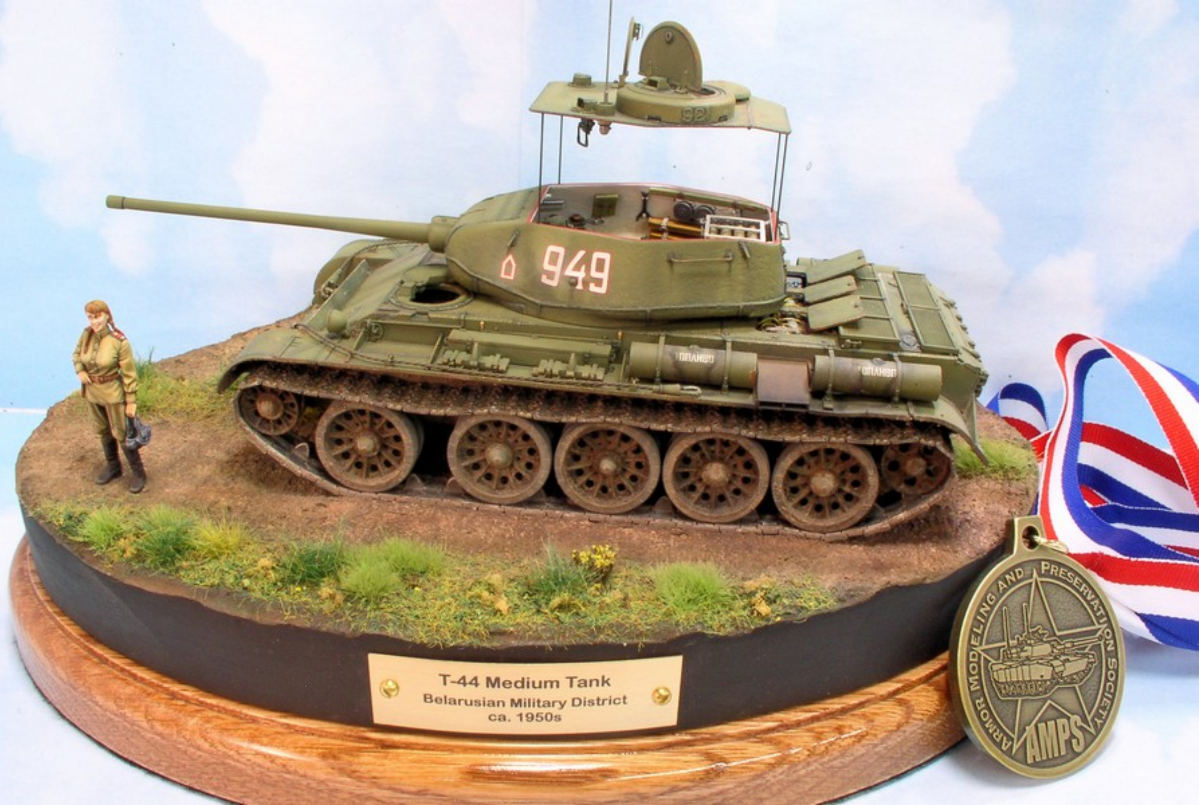
T-44 Medium Tank Belarusian Military District ca. 1950s