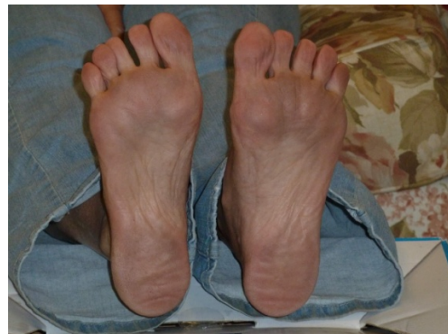
'Can't walk those dogs no more!

Anything that was left over at the end of the day was picked up by people from the Rescue Mission