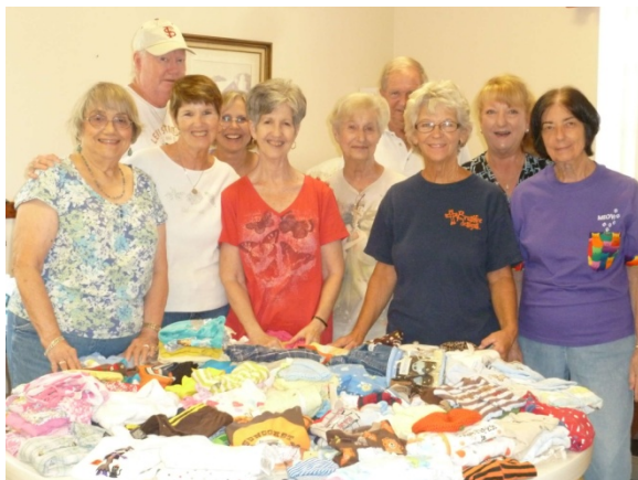
Here is some of valiant crew who put in the hours to make the Yard/Bake sale a success,

The Thursday & Friday prior to the sale workers tirelessly worked