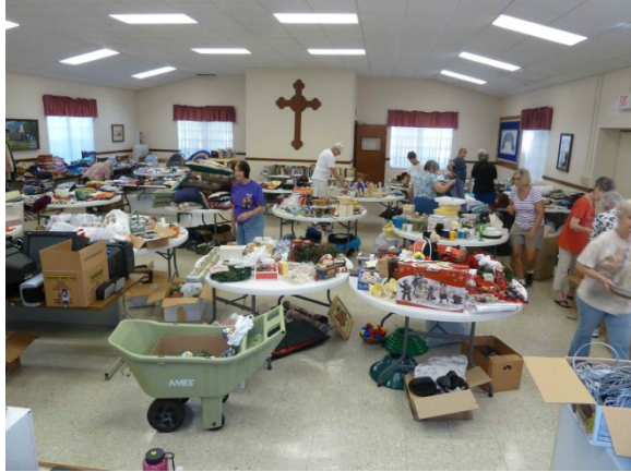
This was the beginning of a very successful Oct.18 sales enterprise.