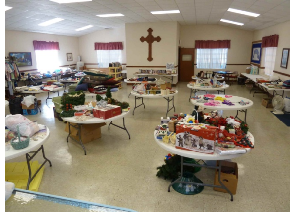
Then there was little left.

setting up the fellowship hall. Bright and early Saturday people were lined up outside the door prior to the 8 A.M. opening anxious to get first pick of our bargains. When the doors closed at 1 P.M. the workers, 12 women & 7 men