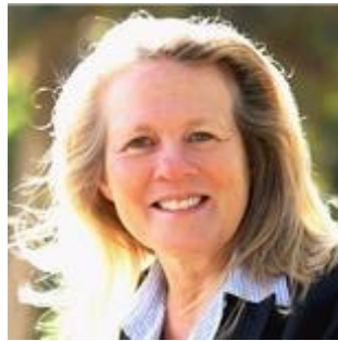
Dr. Judy Mikovits

We are excited to offer our first CVRWF “Evening Dinner Series” event, which kicks off Thursday, January 20th at 5:30pm in San Juan Capistrano – You won’t want to miss our incredible speaker, Dr. Judy Mikovits, a New York Times Best-Selling Author, American hero, patriot and virologist, also a featured expert in the recent documentary “Plandemic.” Dr. Mikovits will discuss some of her ground-breaking discoveries and