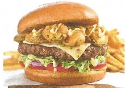
Crispy Jalapeño Burger