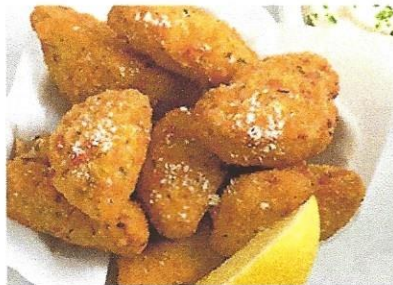
Crispy Fried Artichokes