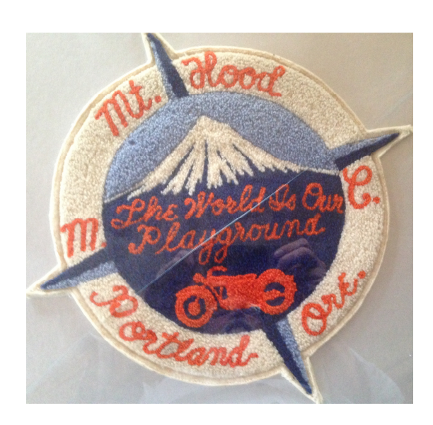
Mt. Hood Motorcycle Club Patch from the 1950s that Chris Cutler discovered at an antique shop.