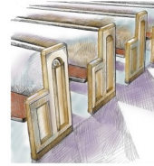
News from the Pews

Music by: Combined Choirs of Aldersgate, St. Peter's and Riverside Baptist.