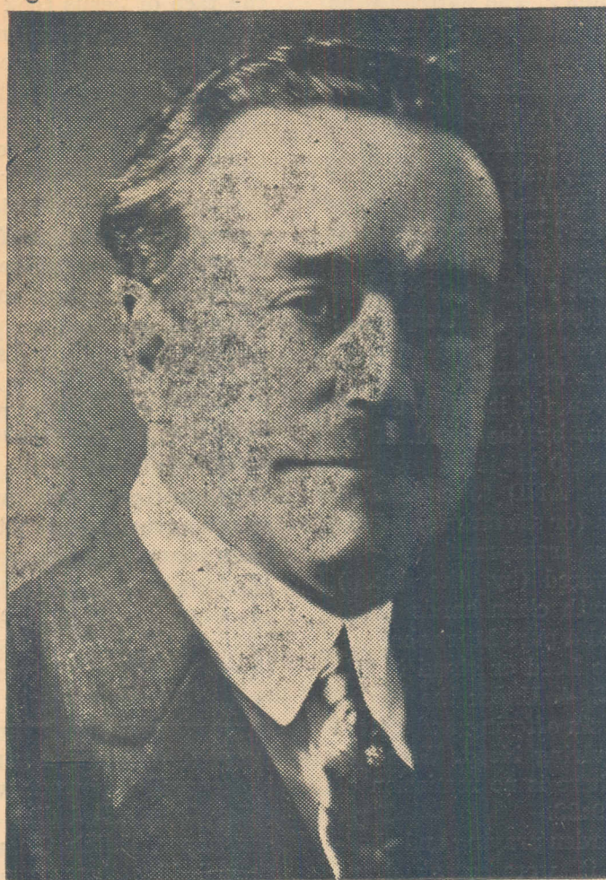
Evangelist Charles F. Parham

Memorial services will be held for Charles F. Parham June 2 at the West End Apostolic Faith church, 909 Knox Street, Houston, Texas. There will be three services and basket dinner at noon. Come and enjoy the fellowship of God's children.