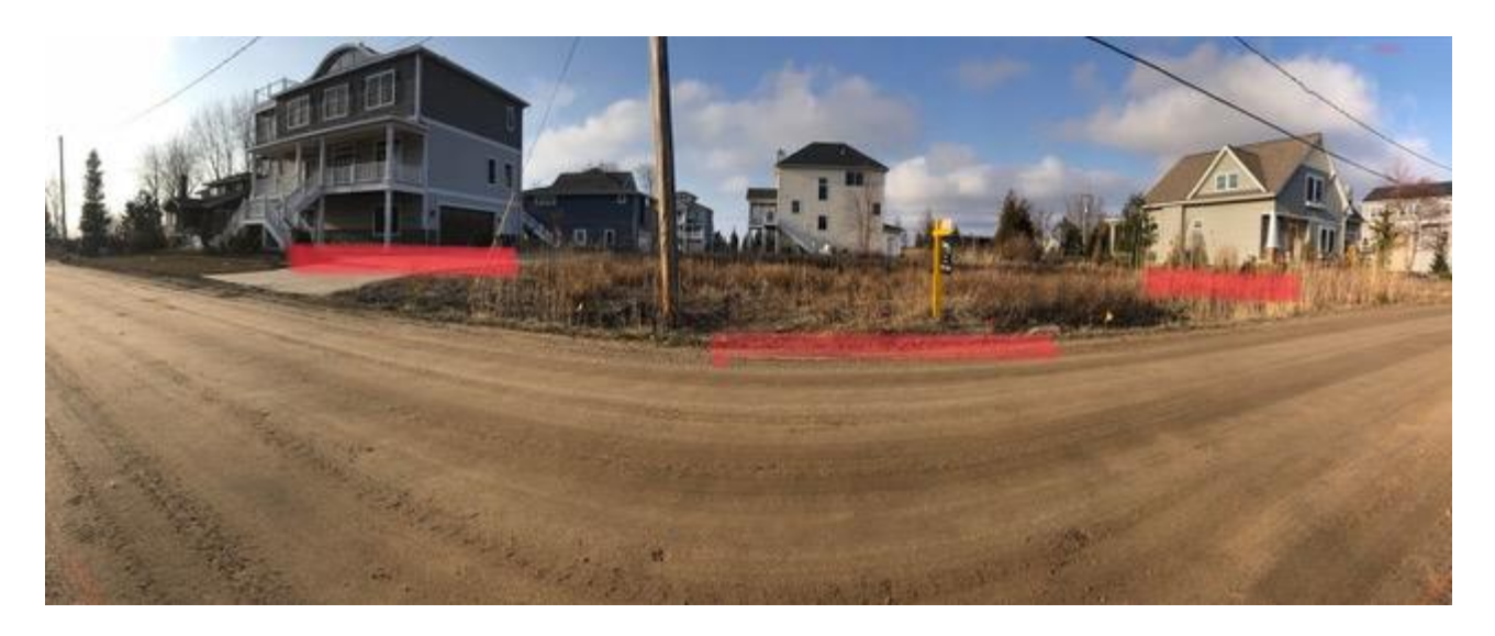
Photo: The north side of Beach where newer homes have built of the grade without regard to the effect of water runoff on neighboring properties and roads. Space between houses approximately 100'.