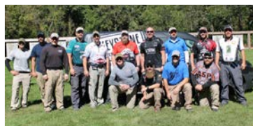
Top 16 Point Series competitors