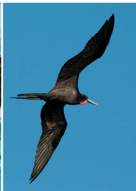
Coffee break at Barefoot Cay; Magnificent Frigatebird [both on Roatán Island]