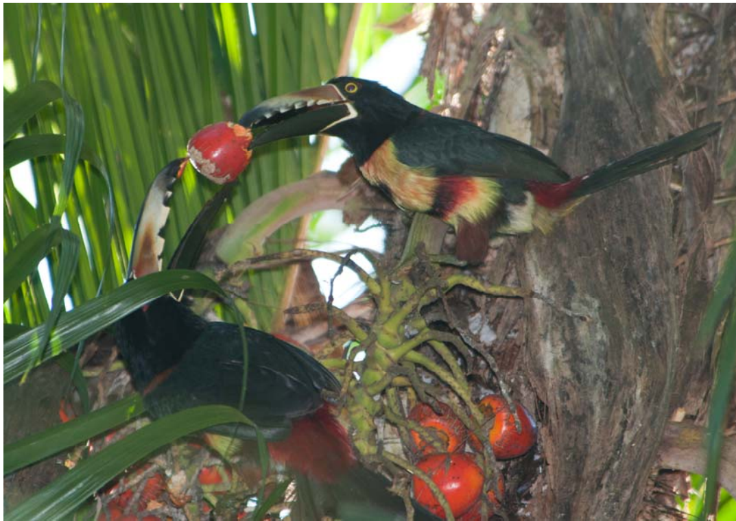
Collared Araçaris [Pico Bonito]