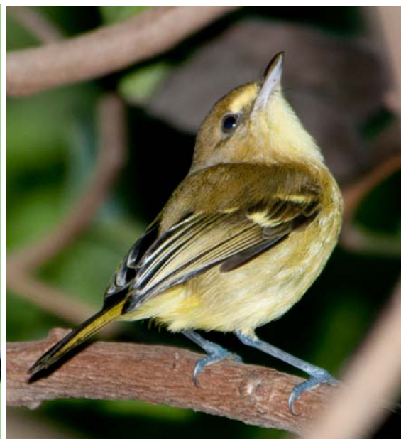
Yellow-bellied Flycatcher [Pico Bonito]; Mangrove Vireo [Roatán Island]

The reef and mangroves around the Barefoot Cay resort on sunny Roatán Island harboured several coastal species, including an Osprey that dramatically caught a fish whilst we were snorkelling nearby. With our energy focused on some excellent boat diving on the Mesoamerican Reef, plus swimming and snorkelling, there was not much time left over for other birding. A couple of dawn and dusk walks across to a patch of mangrove and forest on an adjacent property did, however, add lifers such as Canivet's Emerald, Mangrove Vireo and Palm Warbler amongst several migrant flocks, whilst endemic Ruatan Island Agoutis scurried around in the vegetation near to the water's edge.