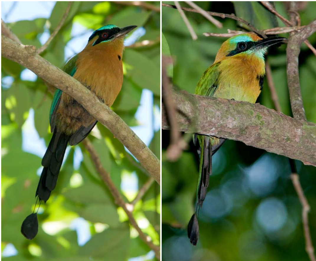
Blue-crowned Motmot; Keel-billed Motmot [both at Pico Bonito]

Our trip started with four nights on the mainland at The Lodge at Pico Bonito, adjacent to the Pico Bonito National Park, where we hiked the forest trails from dawn to dusk and enjoyed the lodge's excellent amenities. Then, after a mere 15 minute flight across the bay to Roatán Island in the Caribbean, we spent a further four nights at the equally well appointed Barefoot Cay dive resort where we focused on diving, supplemented by casual birding in nearby habitats. In total we identified some 117 bird species, of which 41 were lifers – this high proportion of lifers being indicative of the only moderate species overlap with our previous birding to the north in Belize (briefly) and Texas and to the south in Colombia. More details on the individual bird and mammal sightings are included in the list that follows at the end of this report.