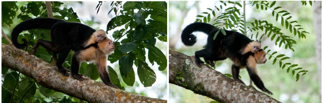
White-throated Capuchin Monkeys [Pico Bonito]

Having been 'self-guided' on the trails for our first two days we did, however, splurge on a guide for our penultimate morning. José proved to be a knowledgeable guide whose Swarovski scope helped us add some quality views of a few new species such as Stripe-tailed Hummingbird (seen calling along the Loop Trail) before we were driven back to the lodge by heavy rain.