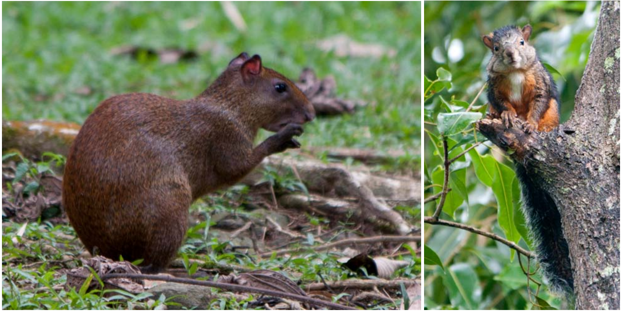
Central American Agouti; Variegated Squirrel [both at Pico Bonito]

Given the one-and-a-half days of sunshine and two days of intermittent to heavy rain showers that we experienced during our stay, four nights at the lodge was the perfect duration for enjoying the lovely setting and birding the immediate vicinity. We did not take any of the available offsite trips, preferring instead to focus on exploring the forest environment on the lodge's doorstep. As much as I would have loved to have seen the Honduran Emerald (the country's only endemic), it was hard to justify the high cost or time required for the full day trip to and from its' dry habitat on the inland side of the mountain range (without any other birders looking to share the guide and transport).