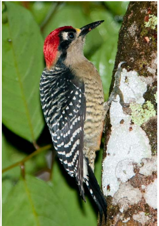
Wood Thrush; Black-cheeked Woodpecker [both at Pico Bonito]

Mammals were also well represented in the area, including squirrels (especially the large and beautifully patterned Variegated Squirrel), Central American Agoutis (that were very partial to the oil palm fruit laid out on the lodge's lawns) and a couple of parties of Tayra heading through the forest. A large troop of White-throated Capuchin Monkeys appeared once (to our mutual surprise) directly below the top of the observation tower whilst we were scanning the canopy for cotingas and on another occasion as they foraged in the cacao plantation. Common Opossum were seen in trees around the lodge's grounds during a night walk that also revealed a Great Potoo perched quietly next to the observation tower.