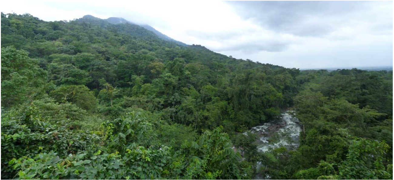
View over the Coloradito River and Pico Bonito National Park from the first observation tower