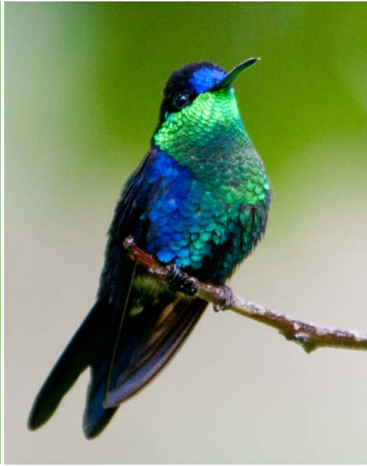
Rufous-tailed Hummingbird; Violet-crowned Woodnymph [both at Pico Bonito]