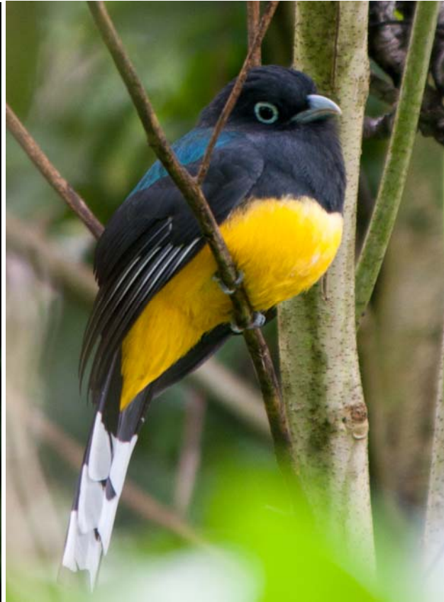
Great Potoo; Black-headed Trogon [both at Pico Bonito]