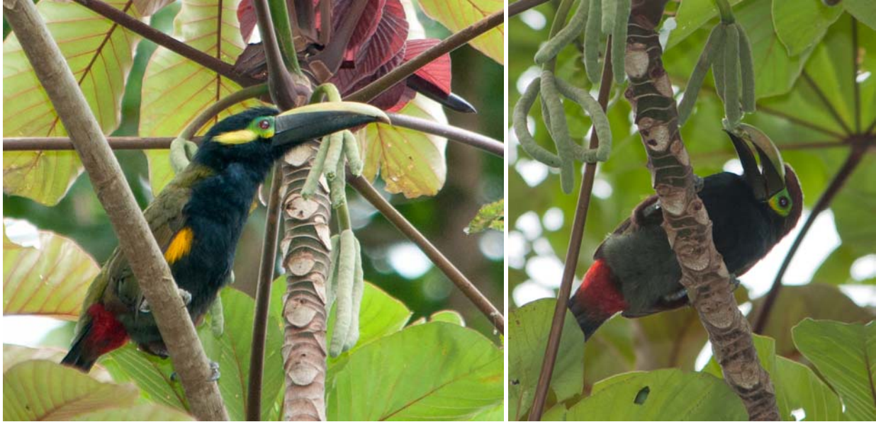
Yellow-eared Toucanet (male and female) [both at Pico Bonito]

Our persistence along the trails resulted in sightings of many other exciting species such as Great Curassow (a striking male walking along the lower reaches of the Loop Trail), Yellow-eared Toucanets (a male near the top of the Loop Trail and a pair feeding in trees at the start of the Loop Trail), White-faced Quail-Dove (perched alongside the Loop Trail), Little Tinamou and Singing Quail (both creeping through the understorey next to the Loop Trail) and Purple-crowned Fairy (seen feeding from canopy flowers at the first observation tower). Charismatic male White-throated Manakins were always popular, however our searches for Red-capped Manakins revealed only females. A multitude of migrant warblers were seen in mixed flocks, whilst several large birds that we flushed from thick vegetation in the forest went unidentified (possibly guans?).