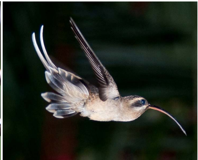
White-throated Manakin; Long-billed Hermit [both at Pico Bonito]