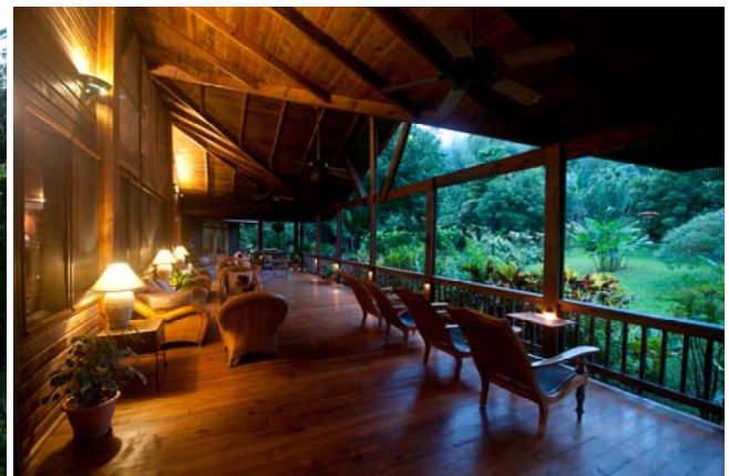
The Lodge at Pico Bonito: Main entrance (with Christmas tree) and restaurant balcony