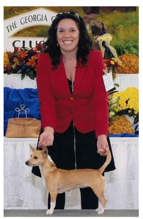
SEL - GCH CH CABRITA DA QUINTA DO SALOIO