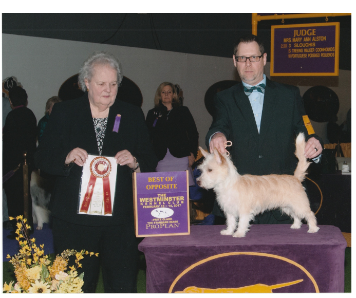
BOS - GCH CH LIN SHAN'S BELLE OF THE BALL