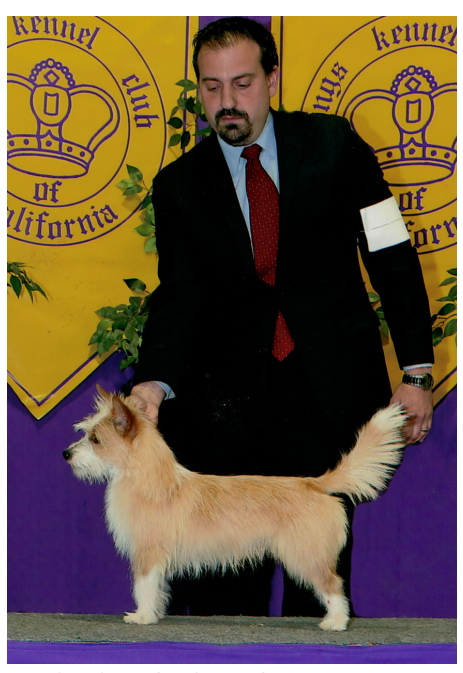
SEL - GCH CH BONSAI NOBLE ADVENTURER