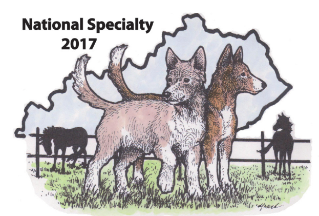
Portuguese Podengo Pequenos of America

Portuguese Podengo Pequenos of America 2017 National Specialty September 2, 2017