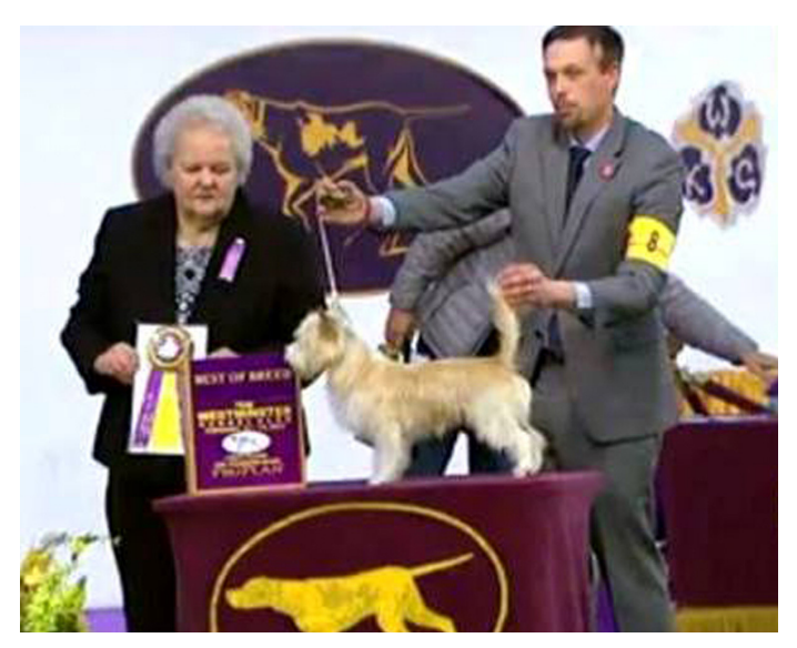
BOB - GCHS CH RADICAL DE VIAMONTE