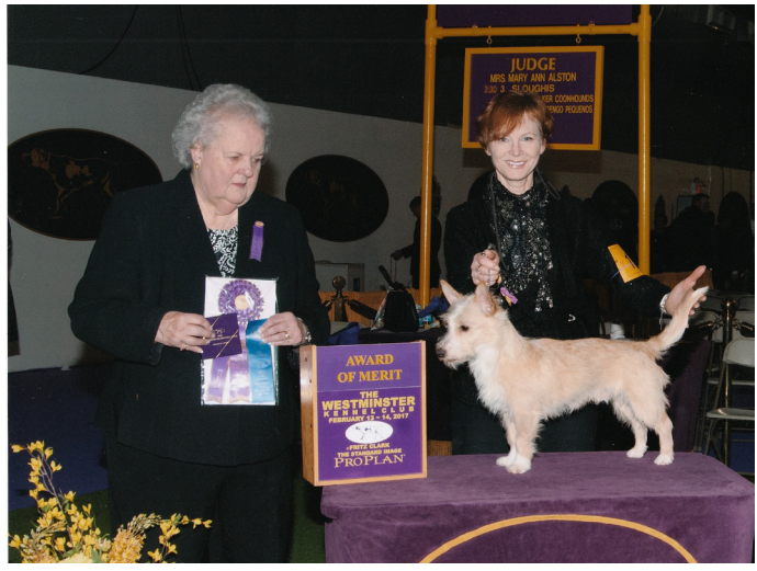
1/W/AOM - LIN SHAN DEXTER MORGAN OF PRESTIGE