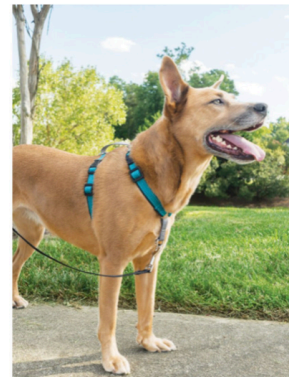
3-in-1 Harness www.premier.com

The Balance and Perfect Fit harnesses are my two favorite because they can clip around the neck as well as around the trunk. Because you don't have to slip the neck piece over the dog's head, it is easier to make the harness appropriately tight around the neck so that it doesn't slip back against the dog's shoulder blades.