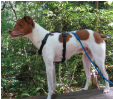
Balance Harness https://www.blue-9.com

I strongly recommend use of nonrestrictive harnesses. Some examples are provided below: