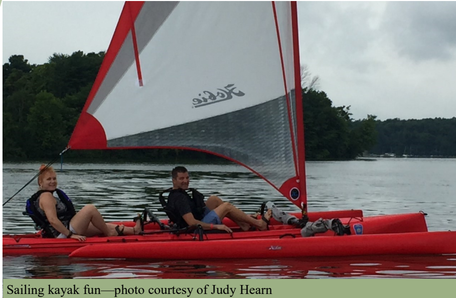
Sailing kayak fun