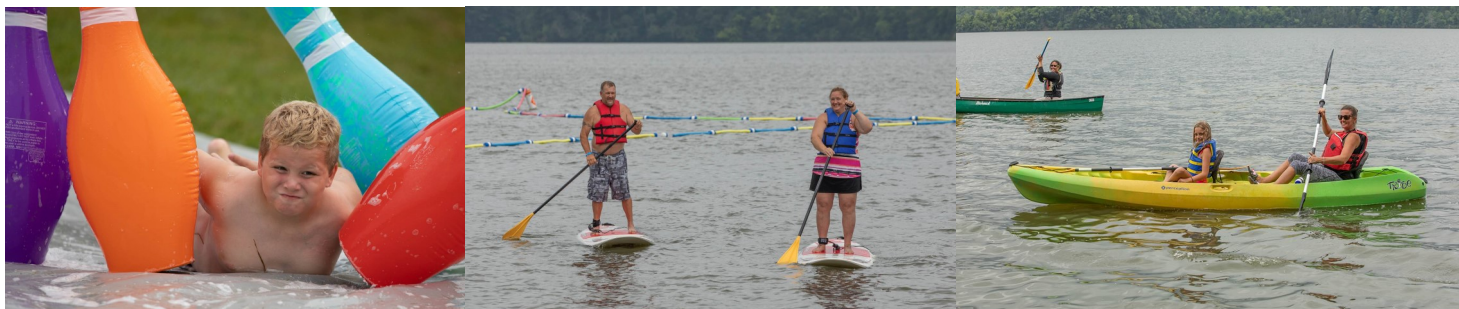
Lake Fest