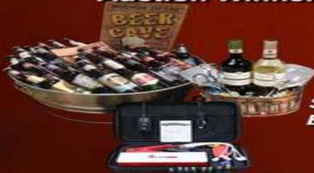
Image may be different than Actual Prize

Auction Winner does not need to be present to win