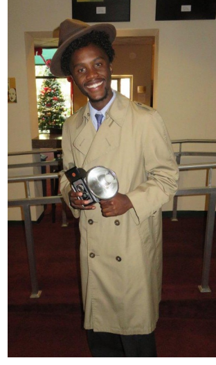
Old-time photographer in the theater lobby