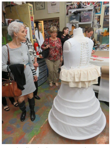
Ladies in the costume shop