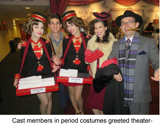
goers before the show.