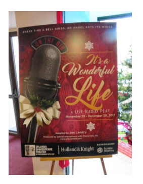
Poster for the play displayed in the theater lobby