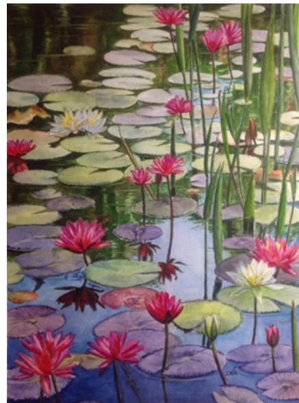
Reflection Watercolor 18 x24

annual art shows at Ringwood Manor, Northern NJ Art Center, Hackensack Art Club, Ridgewood Art Institute and Rutherford Art Club. She has paintings in personal collections. She is a member of the Fort Lee Artist Guild, Hackensack Art Club, Salute to Women in the Arts, KACAL and a Signature Member of the Northeast Watercolor Society.