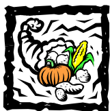
Celebrate the Harvest!

The Schuyler County Historical Society plans on having a booth set up with