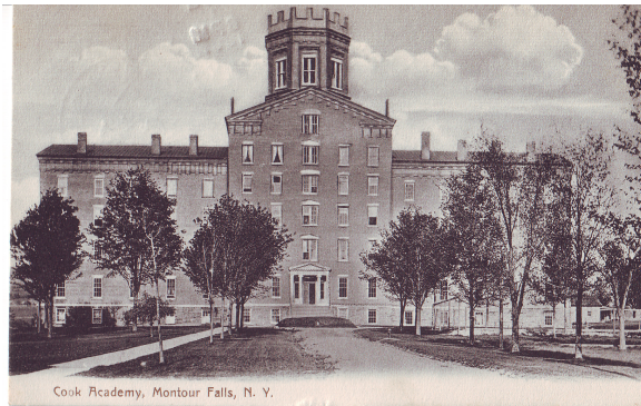
The Cook Academy, circa 1892. The brick tower is no longer there.

laid in 1858. Charles Cook, the builder and