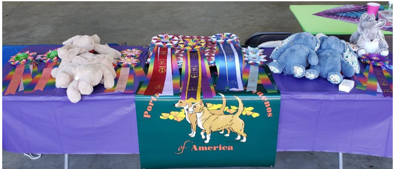
Trophy Table Woofstock 2022