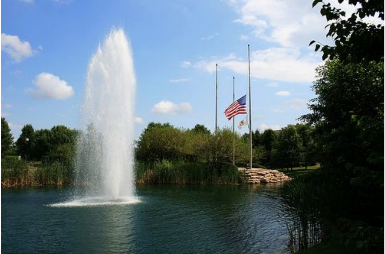
Vernon Hills, IL